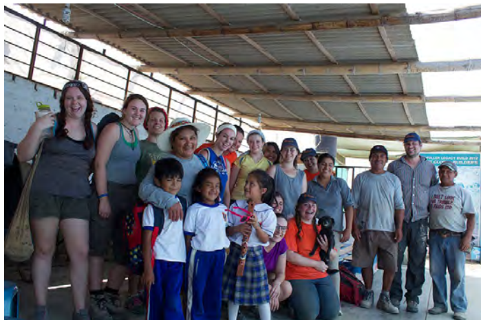
JSC students participating in the spring service trip to Peru pose with some of their host families.