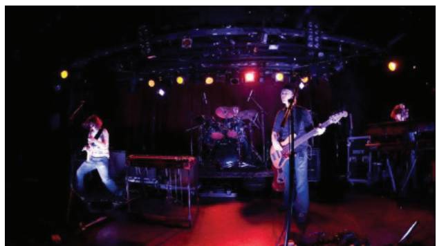
The recent outdoor concert by "The Brew" was a success in musical and also career-related

Six students will be studying abroad next year. They will be studying in Chile, Costa Rica, India, Scotland, Spain, and Australia. Two members of this international contingent will be tracking their experiences via blog, and JSC will have links to these blogs from our website and Blackboard.